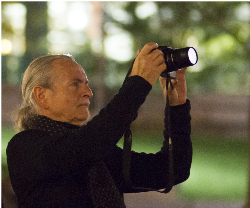
Krzysztof Wodiczko, Montreal, Quebec, Place des Arts, Canada, 2014 (during the Homeless Projection screening)

Ministry of Foreign Affairs of the Federal Republic of Germany. The Mayor of Warsaw is an honorary patron of the project.